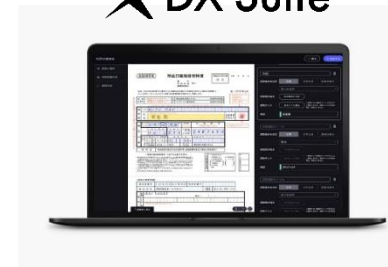
【Screen Image of DX Suite】