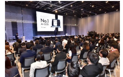
【Speaking at ROCK Thailand #4】