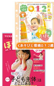
Gakken's nursery contents