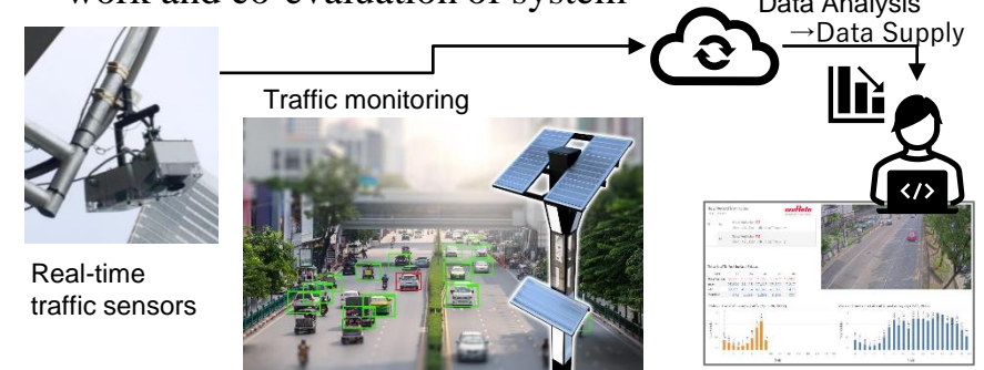
Copyright (C) 2022 JETRO. All rights reserved.