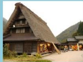
World Heritage Historic Village