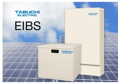
Tabuchi's EIBS Intelligent Battery System

The EIBS system combines an all-in-one inverter with a lithium ion battery that is optimized for reliability, fast payback and simple home installation. The solution delivers compelling cost performance by reliably reducing peak loads for ten years.