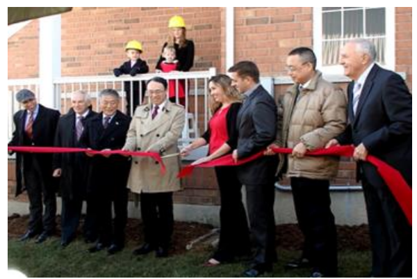
Ribbon-Cutting Ceremony, Oshawa, Ontario

On November 20, 2015, at a ribbon-cutting ceremony held in Oshawa, Ontario, Tabuchi Electric celebrated the first installation of its solar-plus-storage system as part of a broader program being led by Oshawa Power and Utilities Corporation (OPUC) to introduce a grid-friendly residential solar program aimed to capture the benefits of solar power while also improving customer reliability during power outages.