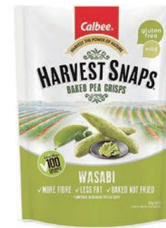
Harvest Snaps Wasabi

Baked pea snacks, which is less fat and high in protein.