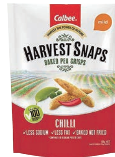
Harvest Snaps Chilli

Harvest Snaps is made from green peas. Harvest Snaps contains higher protein and food fiber as those nutritious value is innate from the raw material green peas. Different from other healthy snacks, its taste satisfy consumer demands to have delicious snacks.