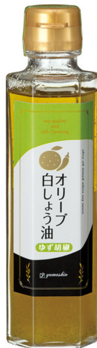
Olive oil + white soy sauce, with yuzu pepper オリーブ白しょう油ゆず胡椒