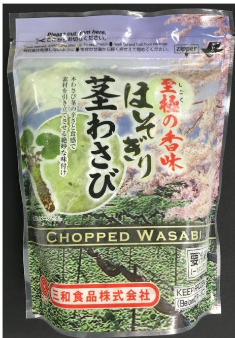
Chopped Wasabi ほそぎり茎わさび