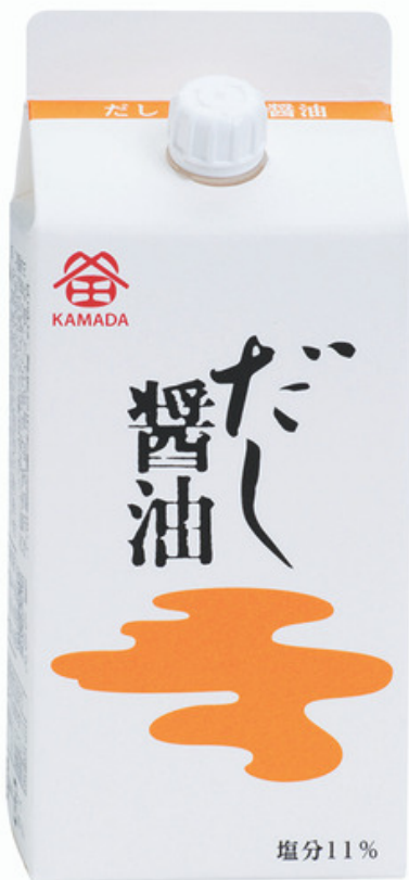
Dashi Soy Sauce だし醤油