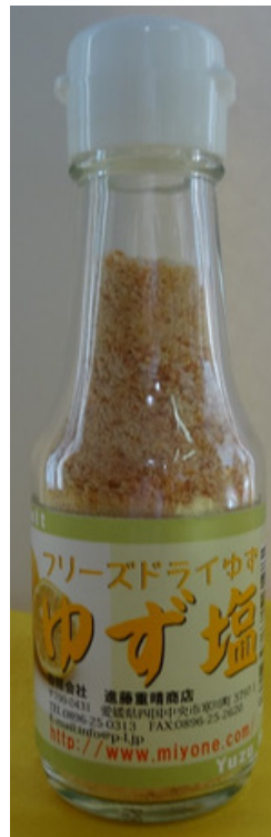
Yuzu Salt ゆず塩