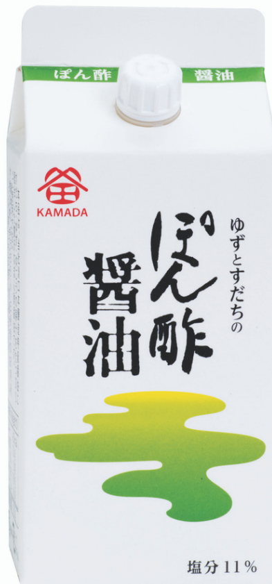
Ponzu Soy Sauce ぽん酢醤油