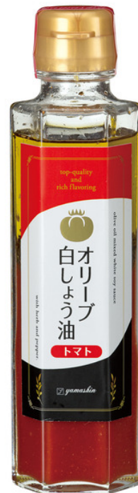
Olive oil + white soy sauce, with tomato オリーブ白しょう油トマト