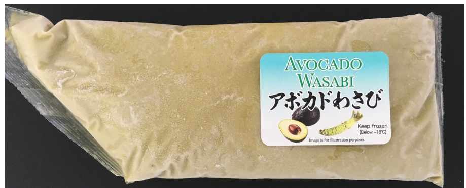
Avocado Wasabi アボカドわさび