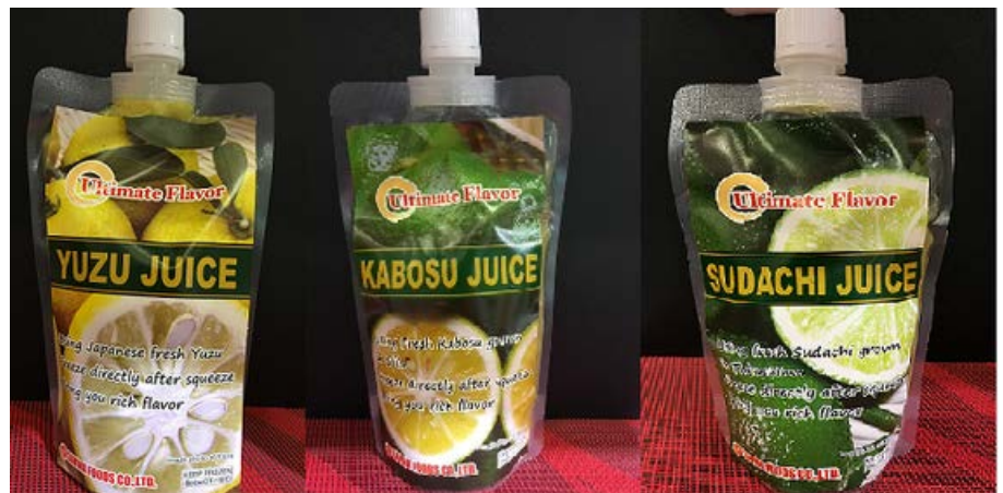
Yuzu, Kabosu, Sudachi Seasoning 冷凍ゆず果汁・かぼす果汁・すだち果汁