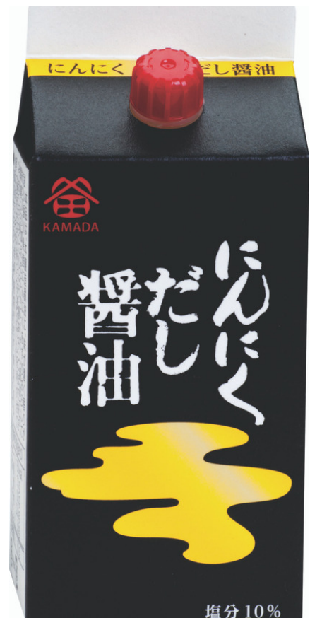
Garlic Dashi Soy Sauce にんにくだし醤油