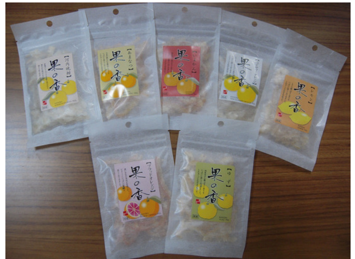
Fruit Peel ピール