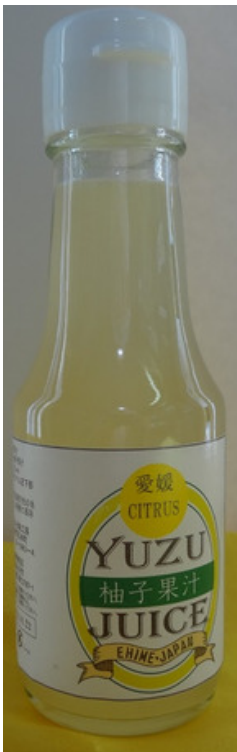
Yuzu Juice ゆず果汁