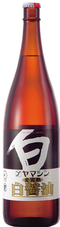
Kin-Kanjuku White Soy Sauce 金完熟白醤油