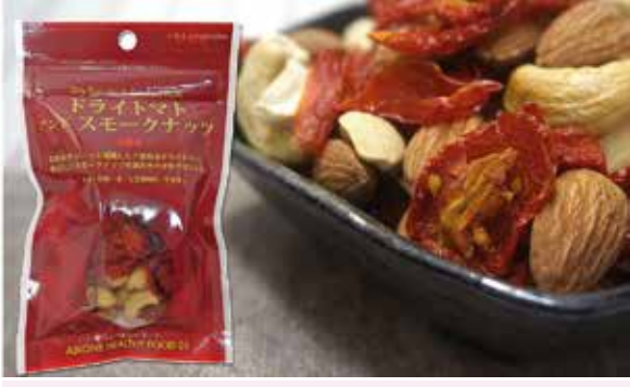
AJI-ONE Healthy Food 01 Dried Tomato and Smoked Nuts Healthy snack pack 'AJI-ONE dried tomato', smoked almonds and cashew nuts. (Nuts are imported from US, India and Vietnam, smoked in Japan.) A great combination of sweet 'AJI-ONE Dried Tomato' and crunchy smoked nuts. It is 100% natural, free from additives, seasonings or food colouring.

'AJI-ONE dried tomato' is made only with the sweetest 'AJI-ONE mini tomatoes' grown in our farm. Free from additives, salt and oil, it is great for snacking and for cooking.