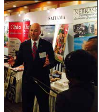
At the Nebraska exhibit at the conference, Governor Ricketts speaks to the media.

After two successful trade missions this year, my administration remains committed to leading two missions each year. As I visit with private and public sector leaders around the globe, those who are familiar with Nebraska tell me that they see Nebraska as a great place to invest. Others who are just getting to know our state are eager to learn more. If you have ideas of your own on how we can continue to promote Nebraska around the world, I would like to hear from you. Please take some time to contact my office at pete.ricketts@nebraska.gov or 402-471-2244.