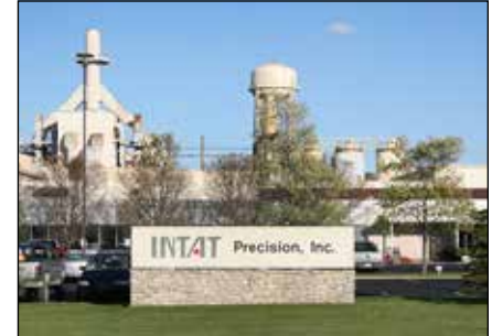
Toyota's INTAT Precision automotive components plant in Rushville

The historic connections with Japan have helped pave the way for companies such as Suncall America, TBK America and Yukiya USA Gasket that give employment to close to 200. Hundreds more jobs are the direct result of positive connections with Japanese companies. We have many corporations, with employees from a dozen to hundreds that do contract work in plastics, fabrication, wires and more for automotive giants Honda, Nissan, Subaru and Toyota. More jobs are available to our employee base around the region, just as jobs here are available to those who live nearby. We always strive to bring companies to our town