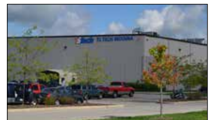
The TS Tech Indiana Plant in New Castle was honored as a supplier of the year.

Our Japanese friends go home and tell good things about us. You never know where the next Japanese-centered business will come from, the next Japanese-affiliated plant that will hire 200 workers or the next major supplier contract that will keep our successful businesses growing even stronger.