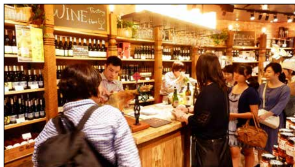
A St. Cousair wine counter in Japan

really liking the new wine. St. Cousair is excited and looking forward to a more successful long-term international business relationship with St. Julian Winery from the State of Michigan.