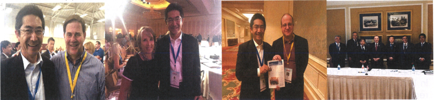
(Pictured left to right: Arizona Gov. Doug Ducey, New Mexico Gov. Michelle Lujan Grisham, Colorado Gov. Jared Polis, Utah Gov. Gary Herbert)

In late July, JETRO attended the National Governor's Association's summer meeting in Salt Lake City. During the meeting, our JETRO officials were able to meet and introduce our 1 st edition newsletter spotlighting our investment delegation to Colorado with Governors in our coverage area. Both JETRO and these Governors agreed to promote and expand business and investment opportunities between Japanese and US companies.