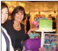
First Lady of Indiana Karen Pence visits a Vera Bradley store in Tokyo.

Governor Pence noted that his wife was visiting Vera Bradley, an Indiana women's handbag and accessory retailer. Vera Bradley expanded to Japan in 2011.