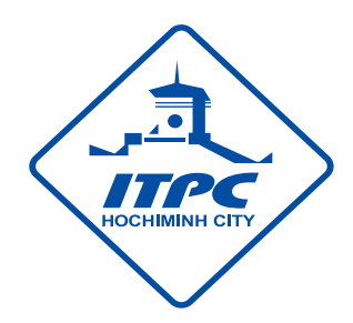
ORGANIZER INVESTMENT AND TRADE PROMOTION CENTRE OF HO CHI MINH CITY (ITPC)