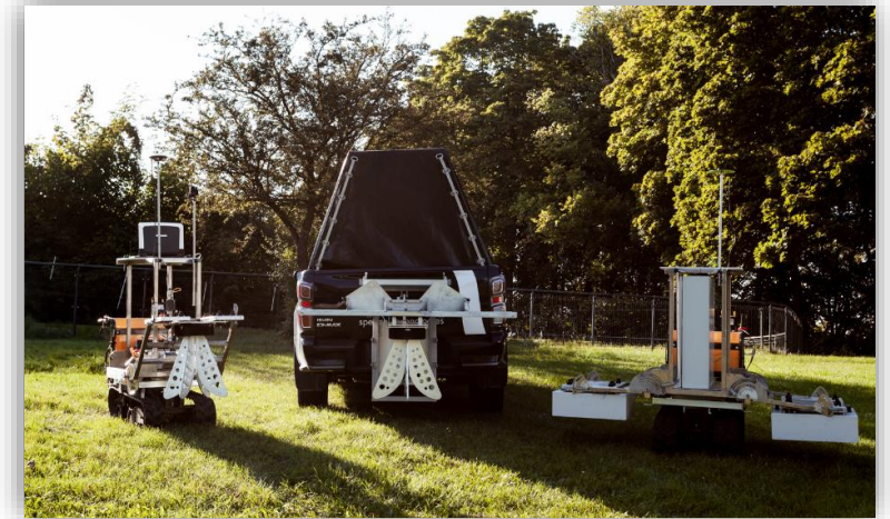
Spectral Ground Penetrating Radar

WIDMO has a diverse source of capital, including public sources (grants, European Commission, European Investment Bank), five or six business angels and a venture capital firm that invested at an early stage. Since 2019, the company has raised a total of approximately €9 million. The majority of this funding, more than 95%, has been earmarked for research and development, reflecting the R&D-intensive nature of the company's business. WIDMO has one granted patent and two patents pending, all of which are international. In terms of certification, the company is currently in the process and expects to complete this by the middle of the year.